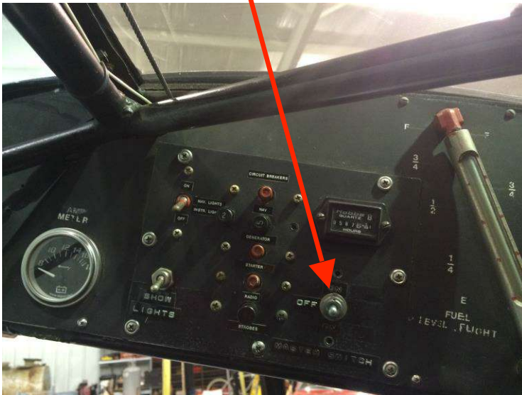
Top Upper Right of Cockpit