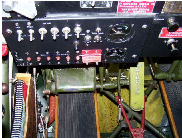
Master Switch under RED Cover – Push DOWN for OFF