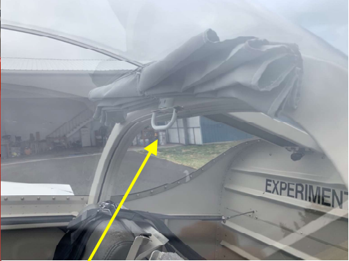
Secondary latch in the OPEN position