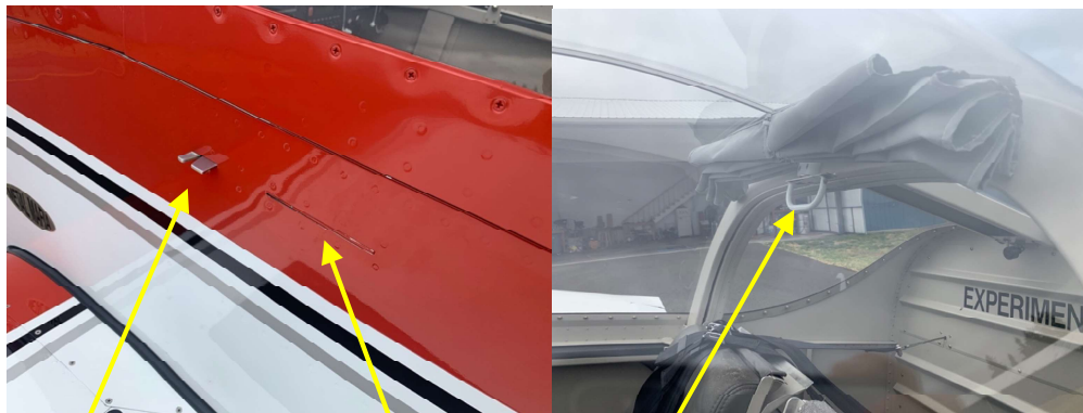
Primary latch, pinch and pull the revealed arm