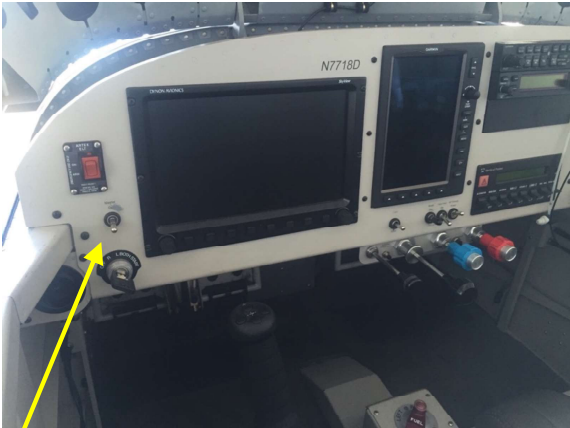
MASTER switch, OFF is DOWN